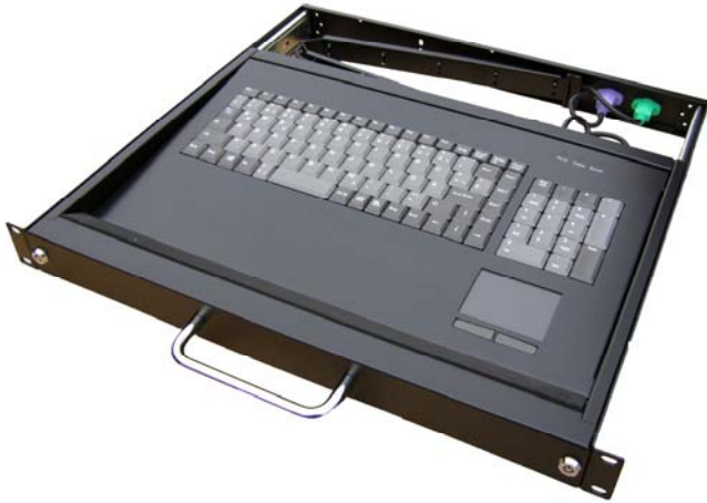
1U Keyboard-Drawer with various mounting slides